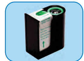
25 Disposable Covers & Dispenser