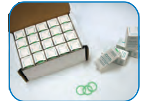
Disposable Probe Covers (DPC-500) come in boxes of 500

“ Even though I was skeptical at first, I have found the Vet-Temp Ear Thermometer to be an excellent tool for quick, easy and accurate temperature measurement. As soon as the patient arrives into the waiting room, we measure an ear temperature and take their weight. By measuring the temperature right away, we prevent false-positive high temperature readings that can occur when a stressed patient waits for the exam. Also, the Vet-Temp measurement allows for the quick assessment of summertime hyperthermia facilitating immediate cooling if needed. The Vet-Temp Ear Thermometer has been a great addition to my practice. ”