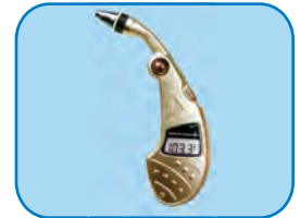
VT-150 Ear Thermometer