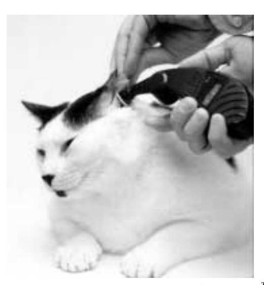
Fig. 1 Measuring temperature with Vet-Temp<sup>TM</sup> (model VT-100) instant ear thermometer

infrared probe is positioned at the end of an extended folding sensor arm which is inserted into the animal's ear until it reaches the intersection of the vertical and horizontal canals. Measurement time is less than 1 second, signaled by a short audible beep. The device displays an adjusted temperature (rectal equivalent) which is +0.6^{\circ}C ( +1.0^{\circ}F ) over the blackbody setting. The calibration of the VT-100 was tested with a laboratory cavity-type blackbody having emissivity of 0.99 and temperature uncertainty of no greater than 0.03 °C. To compensate for the device calibration shift of +0.11^{\circ}C , the collected data were corrected by -0.11^{\circ}C .