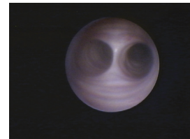
Bifurcation in Lung

“This compact semi-flexible endoscope is the perfect size (1.7mm outer diameter) for evaluating the nasal cavity of small dogs and cats. It can also be used for ear examinations, is portable and durable.”