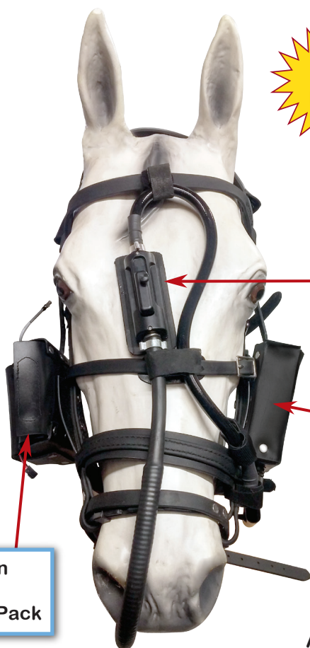
TV-506 Articulating Model