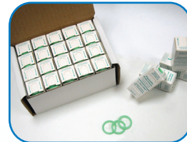
Disposable Probe Covers (DPC-500) come in boxes of 500

“Even though I was skeptical at first, I have found the Vet-Temp® Ear Thermometer to be an excellent tool for quick, easy and accurate temperature measurement. As soon as the patient arrives into the waiting room, we measure an ear temperature and take their weight. By measuring the temperature right away, we prevent false-positive high temperature readings that can occur when a stressed patient waits for the exam. Also, the Vet-Temp® measurement allows for the quick assessment of summertime hyperthermia facilitating immediate cooling if needed. The Vet-Temp® Ear Thermometer has been a great addition to my practice.”