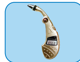
VT-150 Ear Thermometer