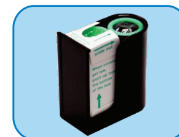
25 Disposable Covers & Dispenser