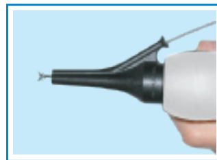
Top View of Working Channel with Flexible Forceps*