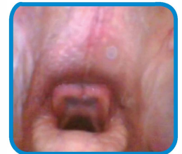
Normal Horse Larynx